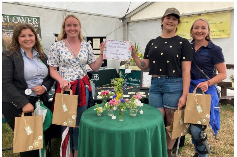
Tablescapes created by; a budding young ‘designer’ and also Beeston Young Farmers