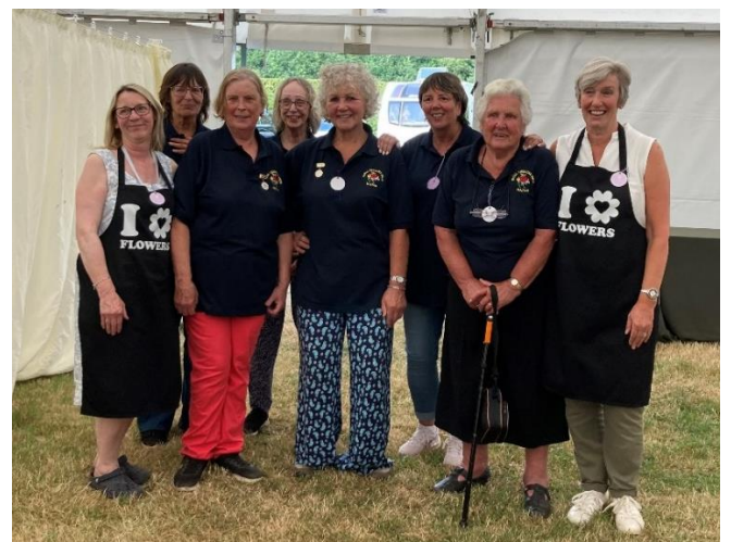
Show Team 2023 – at the end of a very successful show. Exhausted but happy!