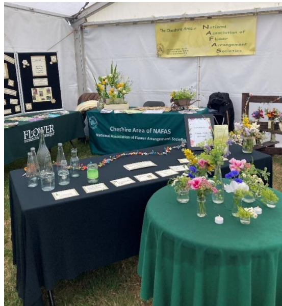
Our Area Publicity corner – introducing visitors to ‘Creating a Tablescape’