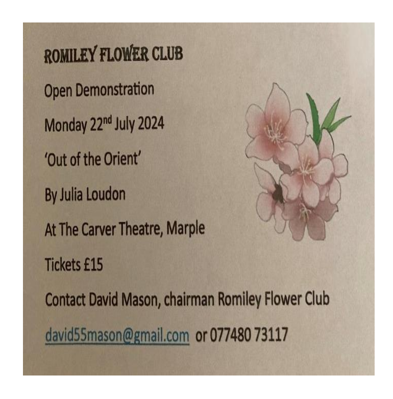
If you are organising an event and would like to publicise it here, please let us know.