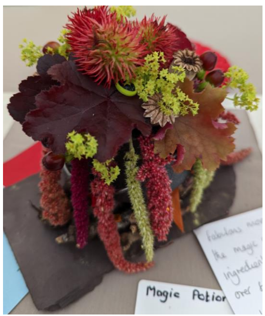
1<sup>st</sup> Place 'Magic Potion' Carol Baker